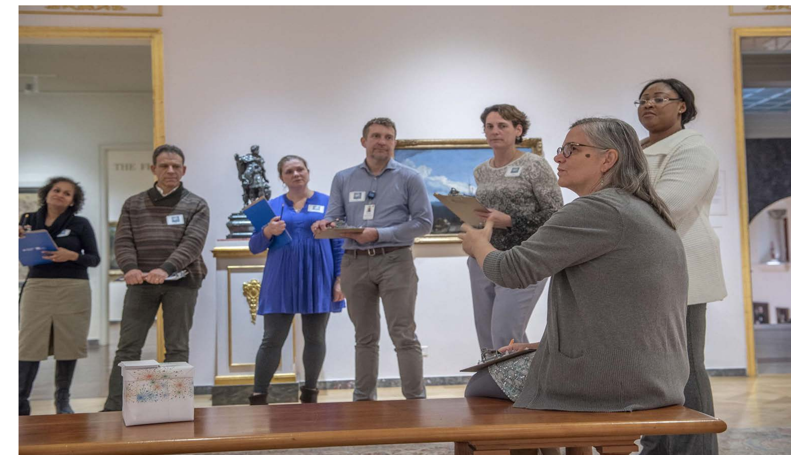
Participants debrief an exercise in one of the galleries.

Other institutions could incorporate sessions like this by engaging a Humanities-trained professional educator.