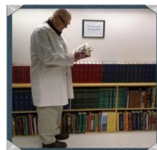
A local scholar browses the collection

His personal library of some 244 books includes publications from the numerous disciplines that contribute to Hand Surgery and Hand Therapy as regional subspecialties. The Journal Hand Surgery (American), The Hand - replaced by the Journal of Hand Surgery (British) - and the Journal of Hand Therapy all include volume 1. The volumes are cataloged and held in a